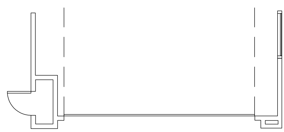
2 Main Level - Proposed 1/4" = 1' - 0"